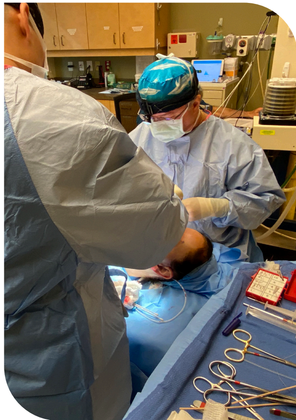
AAAASF Surgery Center On-Site

WE HAVE FLEXIBLE FINANCING CHOICES AVAILABLE THROUGH CARECREDIT®